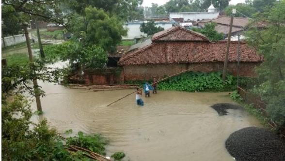
Figure -5 Houses inundated in flood water