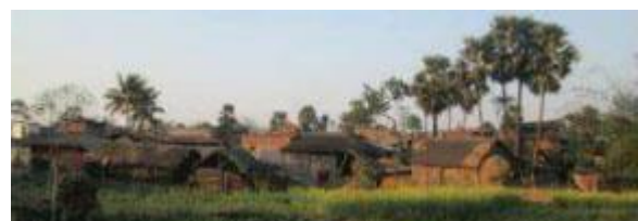
Figure Error! No text of specified style in document.-4 Vernacular Architecture in Kosi region (Alam, 2021)