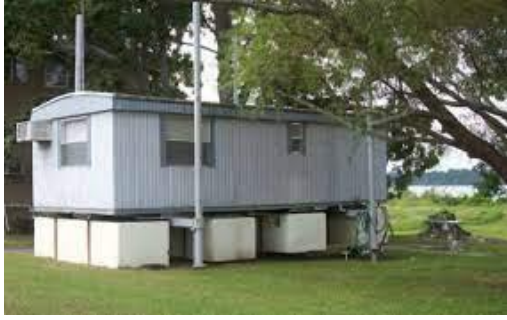
Figure Error! No text of specified style in document.2 Amphibious Housing in Louisiana