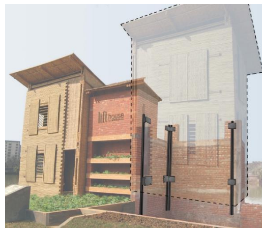
Figure Error! No text of specified style in document.1 Lift House (Prosun Architects)

Strategies for excluding water from a structure are often referred to as resistance and dry flood proofing. Sandbags and improvised flood boards are regularly utilised by the indigenous population to stop the water from entering during emergency situation. These are temporary methods that are frequently used. It is designed in such a way that it prevents flood water from entering the structure and minimize the impact. It also gives occupants more time for relocation. While sandbags and other temporary solutions may slow infiltration and damage, they are neither sufficient nor long-lasting.