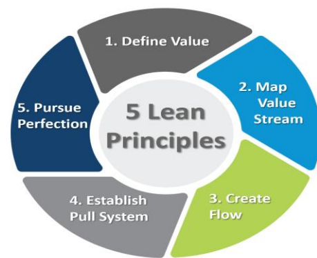
Fig .4 Lean Principles

Meet customer needs and expectations within agreed schedules and in the face of deficiencies. The only reason for that is the intensive communication not only with customers/clients, but also with managers and employees.