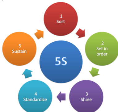
Fig .2 The 5-S

5S Shitsuke : Sustain, Custom and Practice, Self discipline.