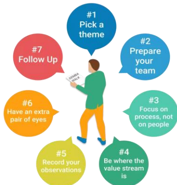
Fig .3 Gemba walk in 7 steps

Here, work is done to gain greater insight into how the process is performed and identify areas for improvement.